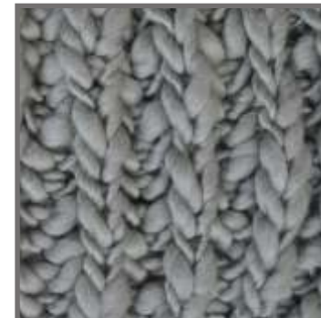
1939001B - 1738501B