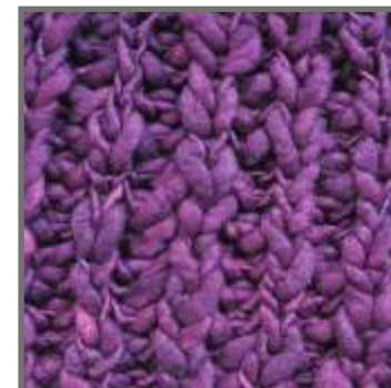
1939001C - 1738501C