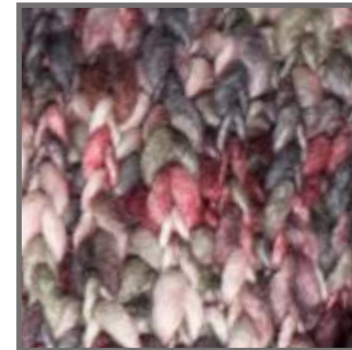
1939001A - 1738501A